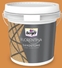
Part B - 20 Kg